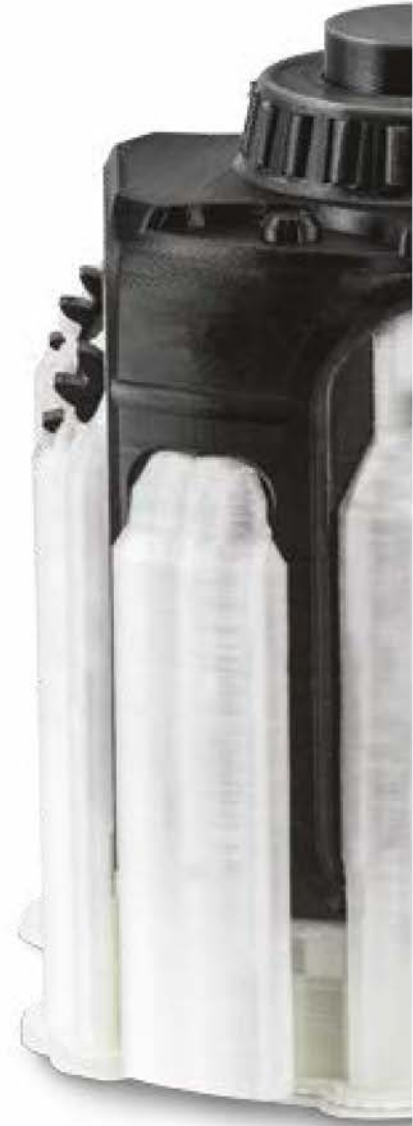
Model with Z-SUPPORT material.

Together with Zortrax Inventure comes DSS, the Dissolvable Support System. Starting now, you can print complex parts or entire moving mechanisms in one print. DSS is a unique solution that lets you save even more time. Just put the printed object into the water and watch the support disappear, leaving the model free from residue.